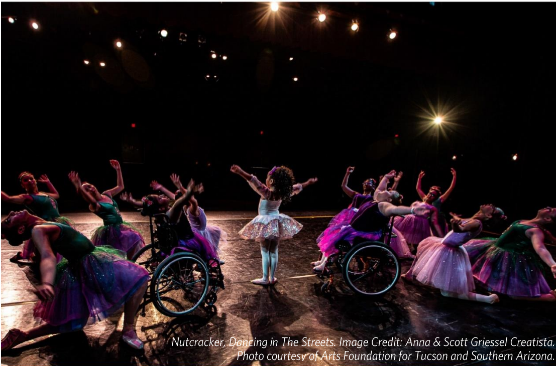
Nutcracker, Dancing in The Streets.