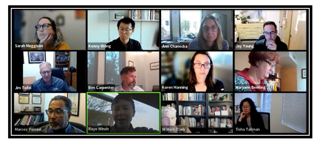
The CEHD December 2023 meeting on Zoom.

Subcommittees: Affordable Housing, Housing First and Housing Desegregation